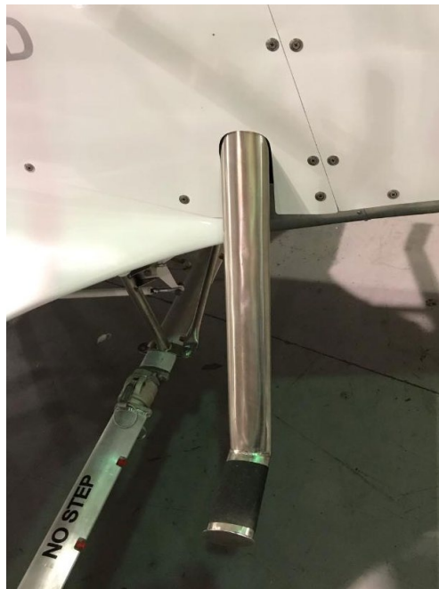
Figure 6: Step Assembly installed on Aircraft