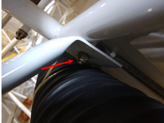
Figure 3: Step Bolt Removal