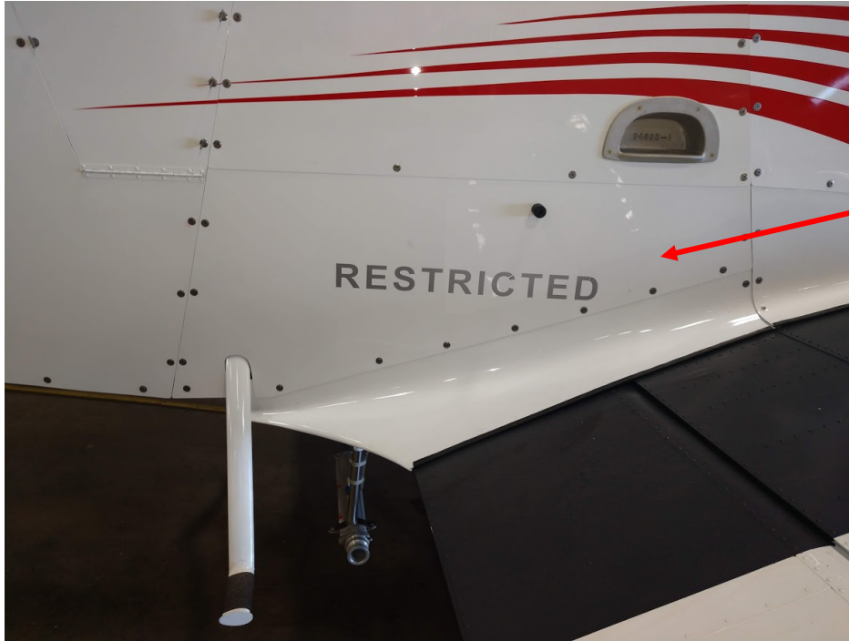
Figure 1: Lower Side Skin Removal (R/H Shown)