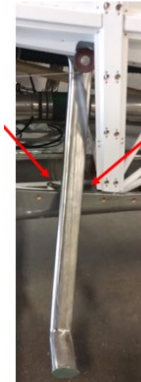
Figure 4: Step Bolt Removal (LH)